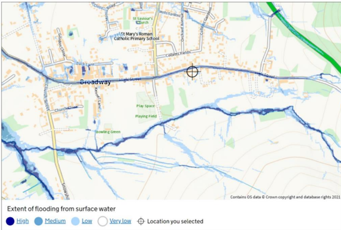
Environment Agency Pluvial (Surface Water) Flood Risk Map for Broadway, showing major streams. High flood risk areas in dark blue.